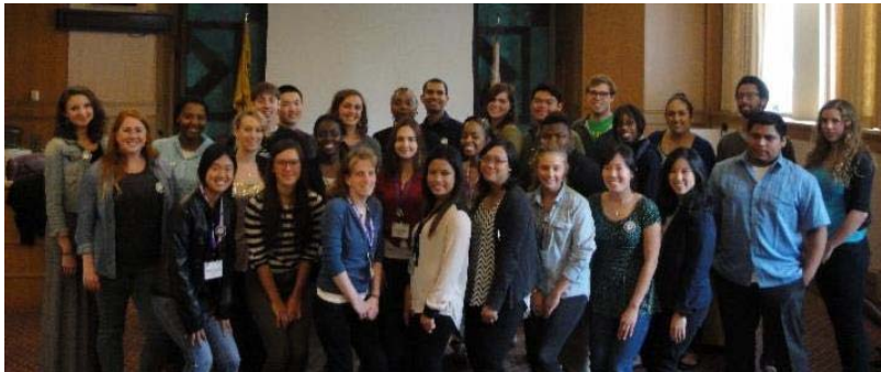
AmeriCorps Elev8 Youth Program Class of 2014

The goals of the program are to increase school connectedness, functioning grade level and reduced absenteeism and suspensions for violence.